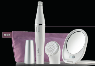
SE830 Braun Face Facial epilator & brush attachment + mirror with light + pouch