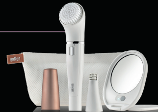
SE831 Braun Face Facial brush & epilator attachment + mirror with light + beauty pouch