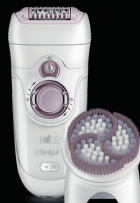
Silk·épil 7 SkinSpa Wet & Dry

Best 2-in-1 Epilation & Exfoliation system